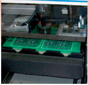
Converter and controller manufacturing